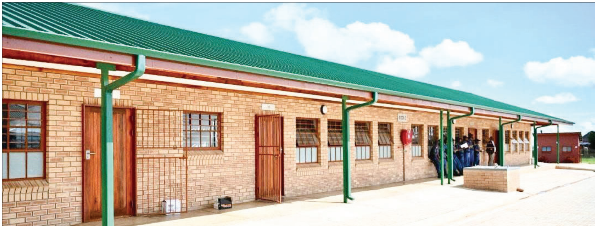
The new schools hand-over is part of the government's infrastructure projects currently taking place across all districts in Limpopo Province.

The Education Department MEC Lerule-Ramakhanya said they have been on a trail to unveil completed infrastructure projects across all districts in the province.