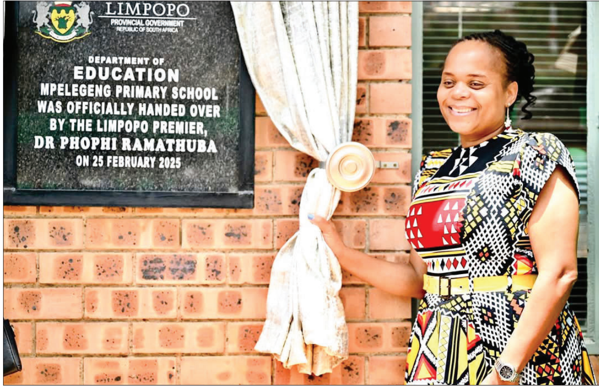
Limpopo Premier, Dr Phophi Ramathuba, officially opening Mpelegeng Primary School at Ga-Moloi Village.