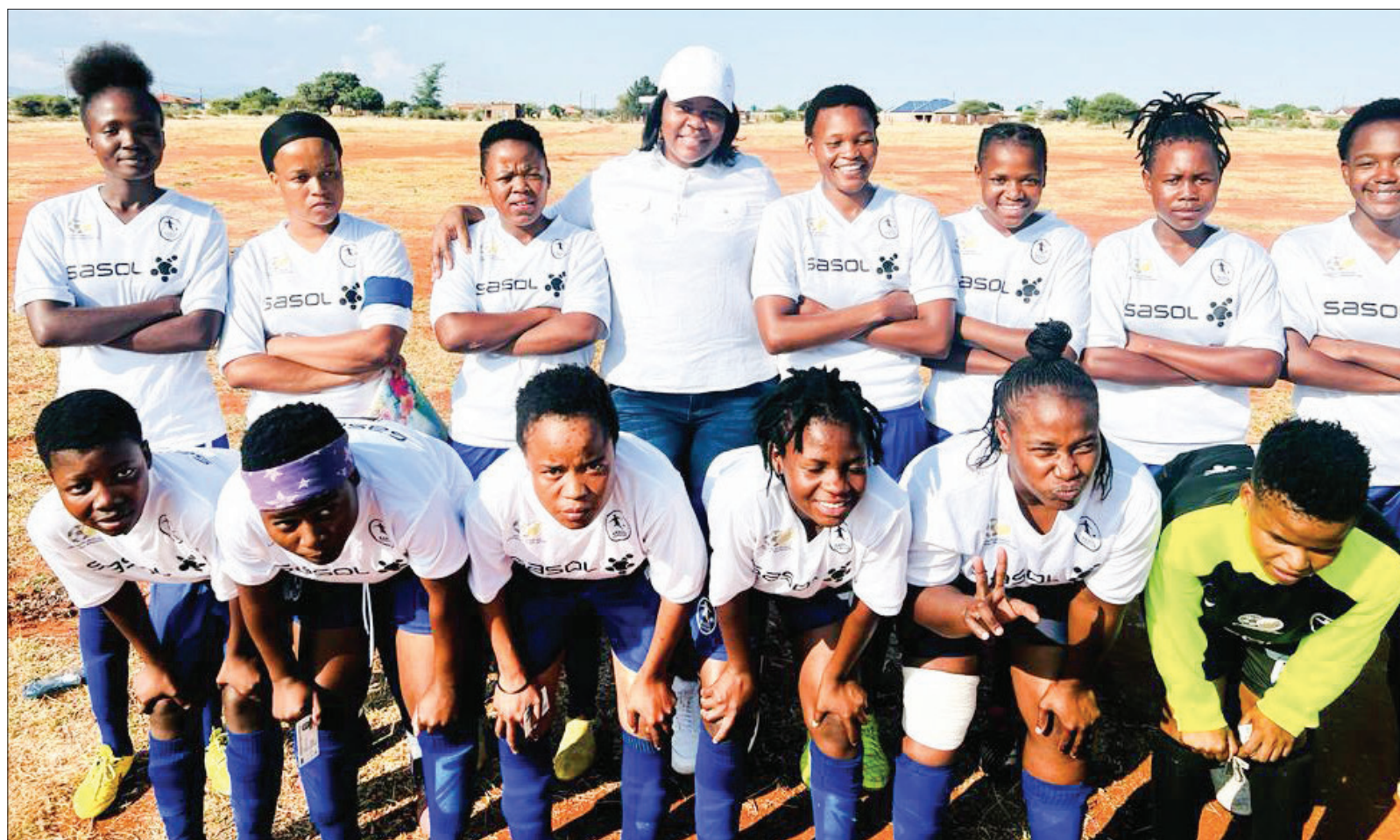
Mashadi Seven Stars is one of the women's football clubs that will be participating within the Sekhukhune Women's Regional Football League.