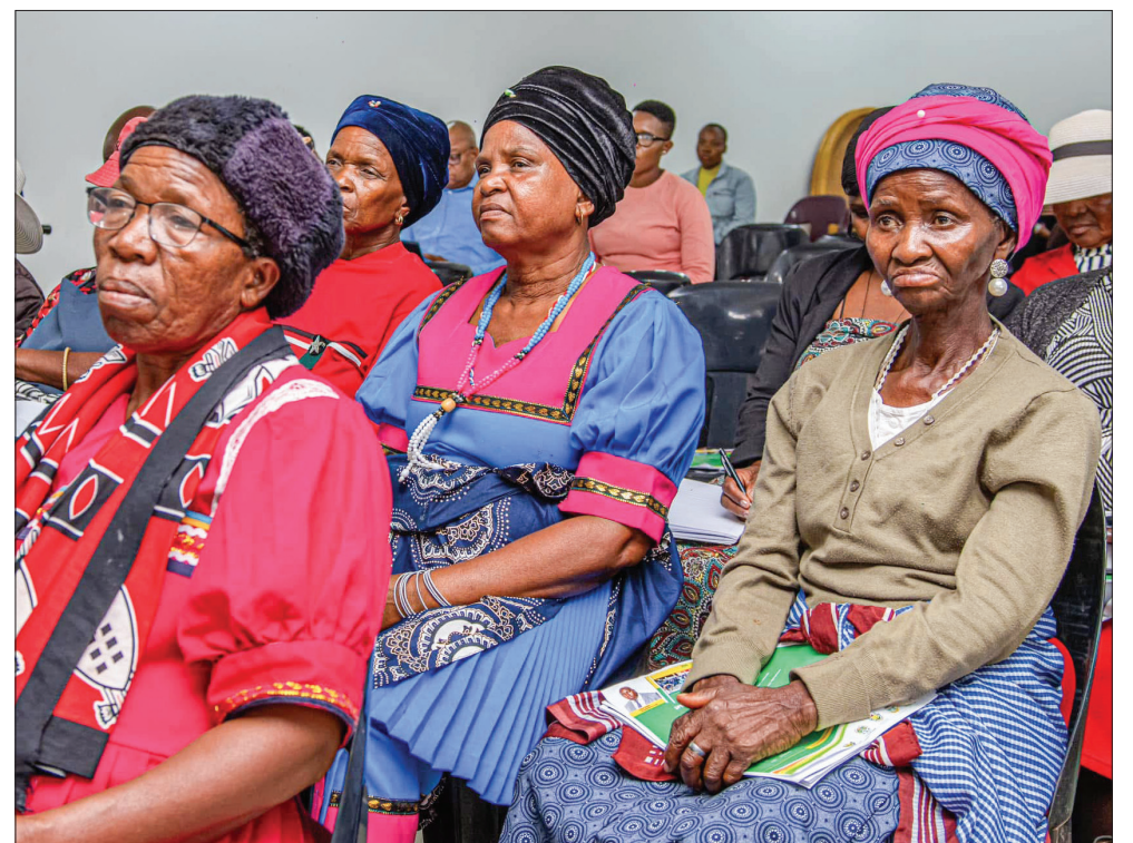
Various stakeholders from different parts of MLM attended in numbers during the municipality's 2023/2024 Draft Annual Report.