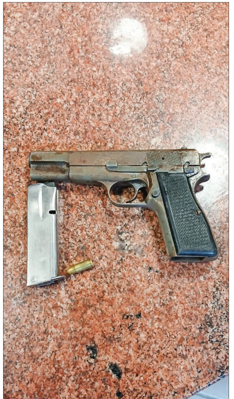
The firearm which was recovered by the police during the arrest of the two additional suspects who were nabbed in connection with the attack of an off-duty police officer.