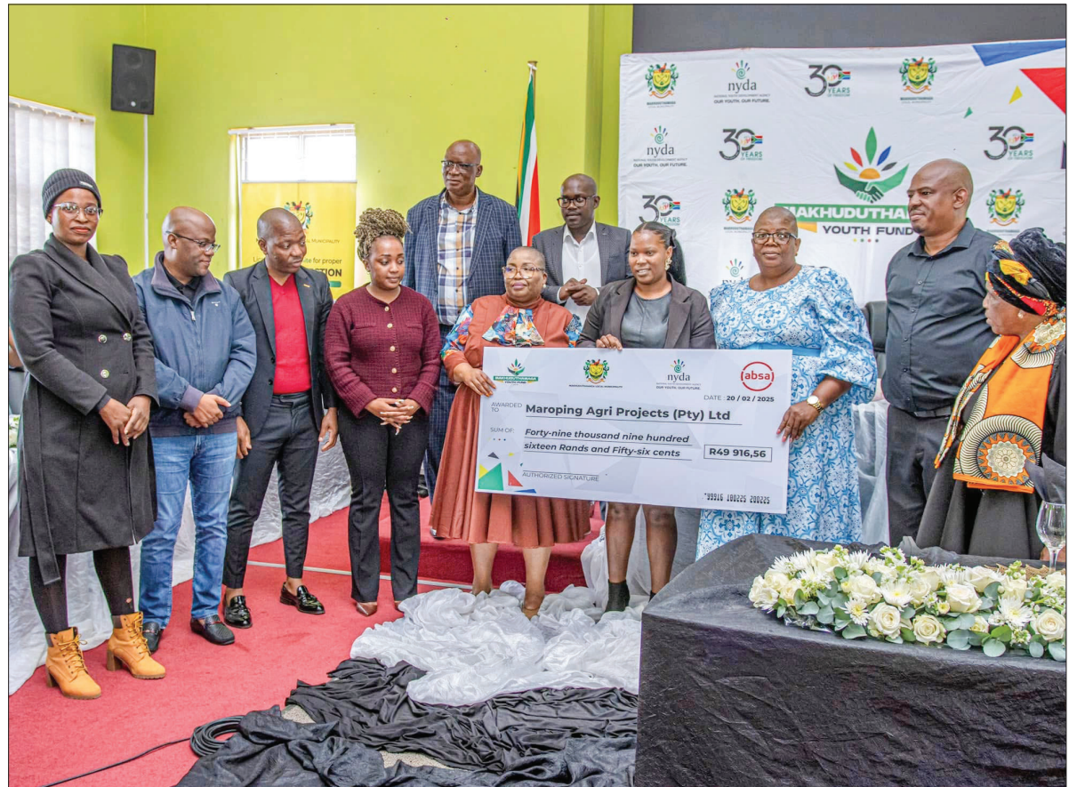
A total of 58 youth-owned businesses from various parts of Makhuduthamaga received funding from the newly inception MYF.