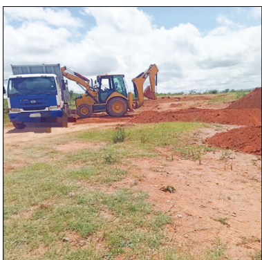
One of the sites where undocumented foreign nationals who mine sand illegally were arrested during the Vala Umgothi Operations on Saturday.

LIMPOPO - The South African Police Service (SAPS) Operation Vala Umgothi in Limpopo led to the arrest of 30 undocumented foreign nationals for contravention of the Immigration Act and for illegal sand mining on Saturday.